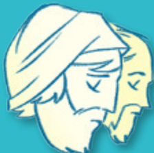
ALMA AND AMULEK