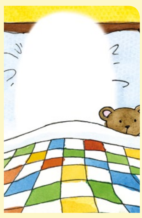
Priesthood blessings can be administered to the sick. Draw yourself in bed, not feeling well.