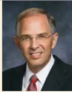
Elder Neil L. Andersen of the Quorum of the Twelve Apostles shares some of his thoughts on this subject.