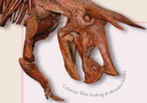
Coleman likes looking at dinosaur bones.