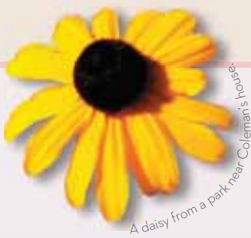
A daisy from a park near Coleman's house.