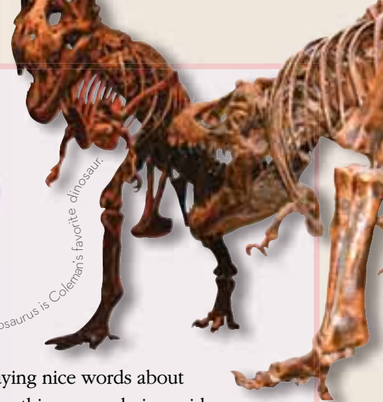
The tyrannosaurus is Coleman's favorite dinosaur.