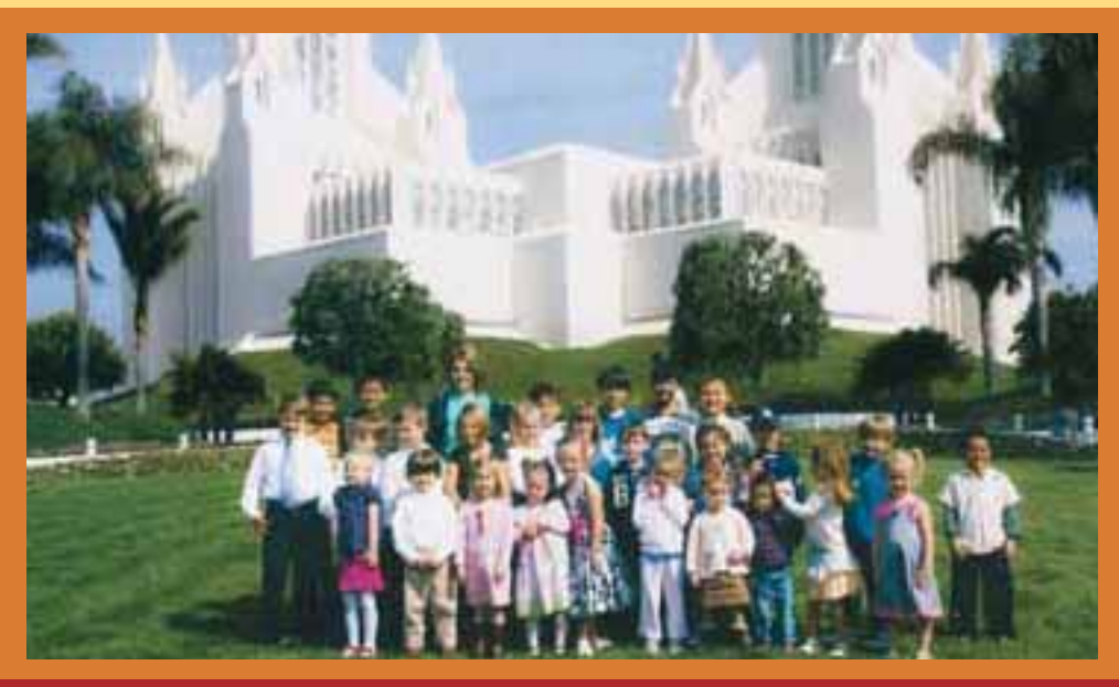
San Diego Sixth Ward

The Primary children in the San Diego Sixth Ward, San Diego California Stake,