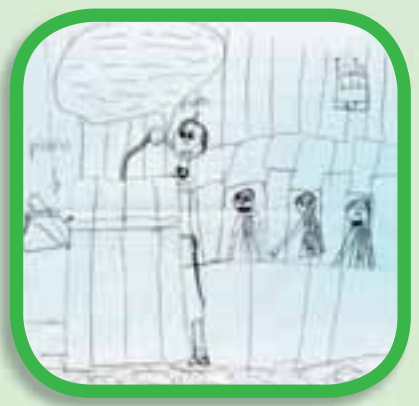
Cyndi K., age 9, South Africa