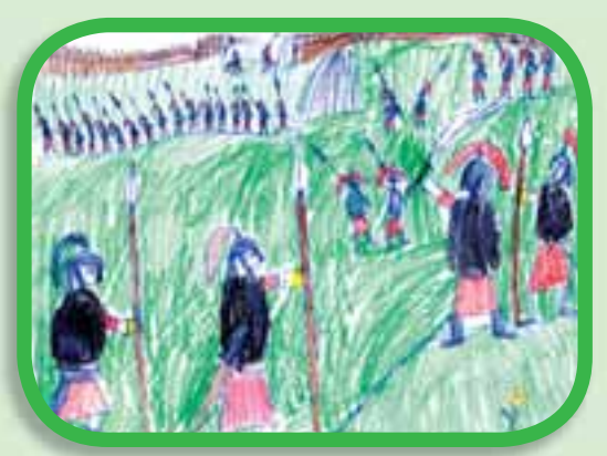
Kelden K., age 7, Utah