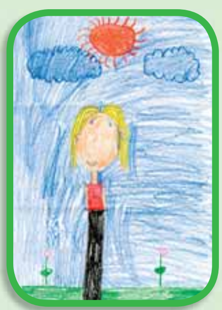
Isabelle C., age 7, Ontario, Canada