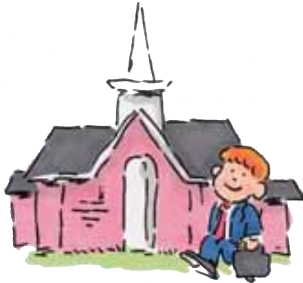
Go to _____