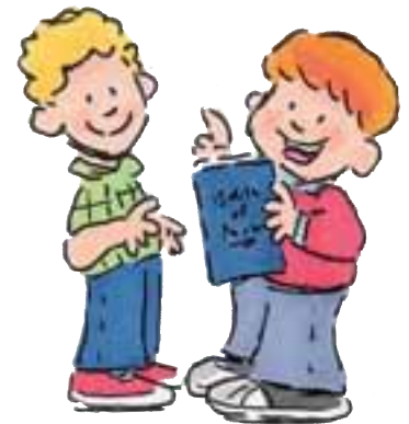
Share your _____