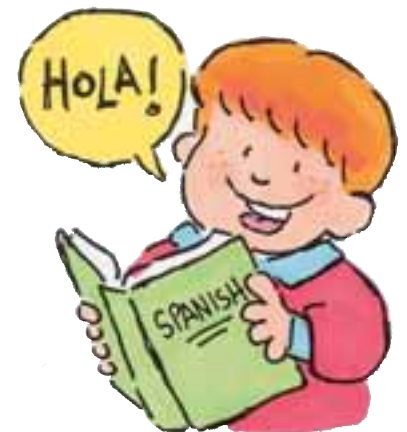
Learn a second _____