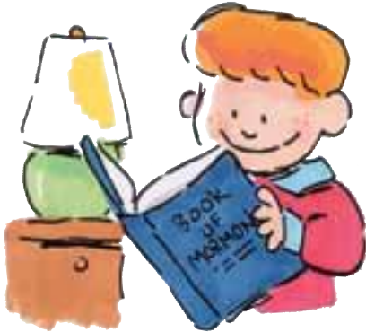
Study the _____

There are things you can do right now to help you prepare for a mission someday. To find out what you can do, read each statement and fill in the blank with the correct word from the list in the center.