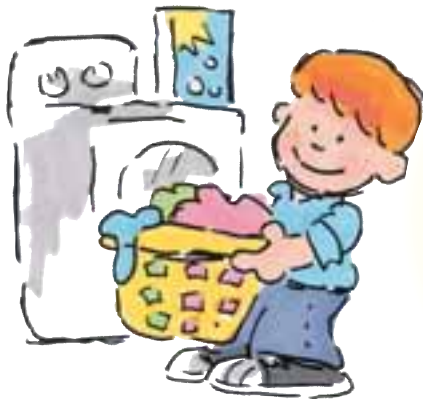
Learn how to do _____