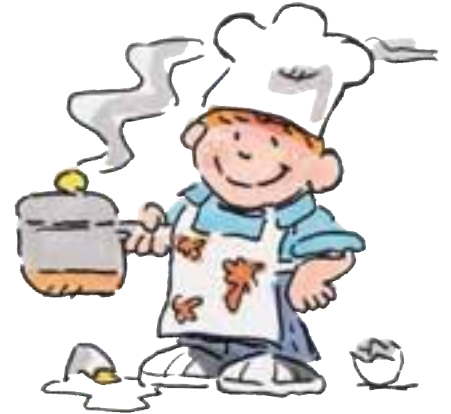
Learn how to _____