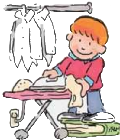
Learn how to _____