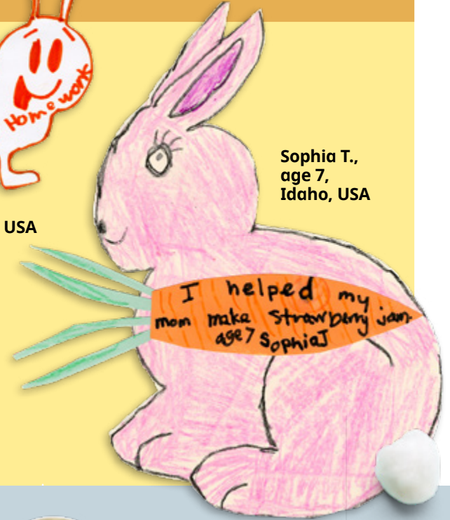
Sophia T., age 7, Idaho, USA