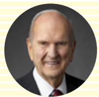
By President Russell M. Nelson