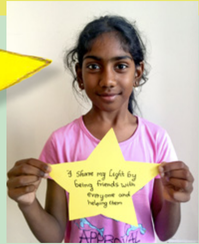
Steffi N., age 9, West Midlands, England