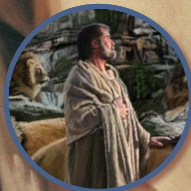
Daniel called Jehovah the Messiah, which is another word for Christ.

an angel told Mary and Joseph to name the baby Jesus. The name Jesus means “Savior” or “God is help.” Because Jesus atoned for our sins, we can repent and receive the gift of eternal life. Jesus was chosen for this special job before the world was created. The name Jesus Christ perfectly describes what the Lord did for us. ♦