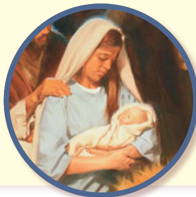
Isaiah prophesied about Mary giving birth to Jesus.

“the anointed one.” In ancient times, a man was anointed with special oil when he was chosen to be a king or priest, so “anointed one” means someone chosen for a special job. Messiah is another word for Christ.