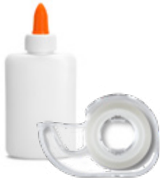
tape or craft glue