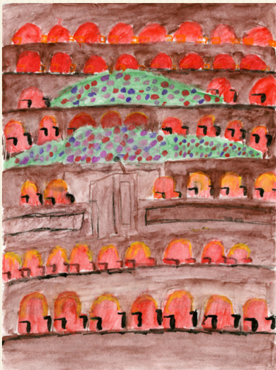
Avy G., age 10, Utah, USA