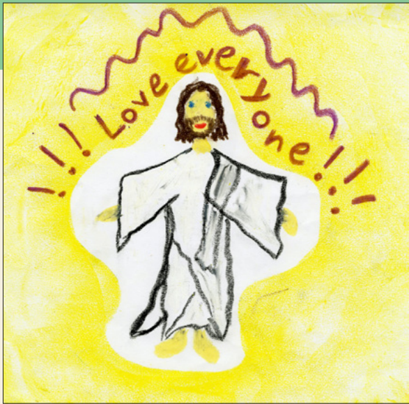
India L., age 8, California, USA