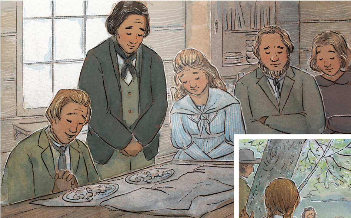
Joseph Smith and Oliver Cowdery blessed and passed the sacrament.