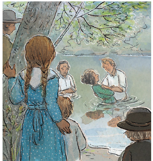
After the meeting was over, several people got baptized.