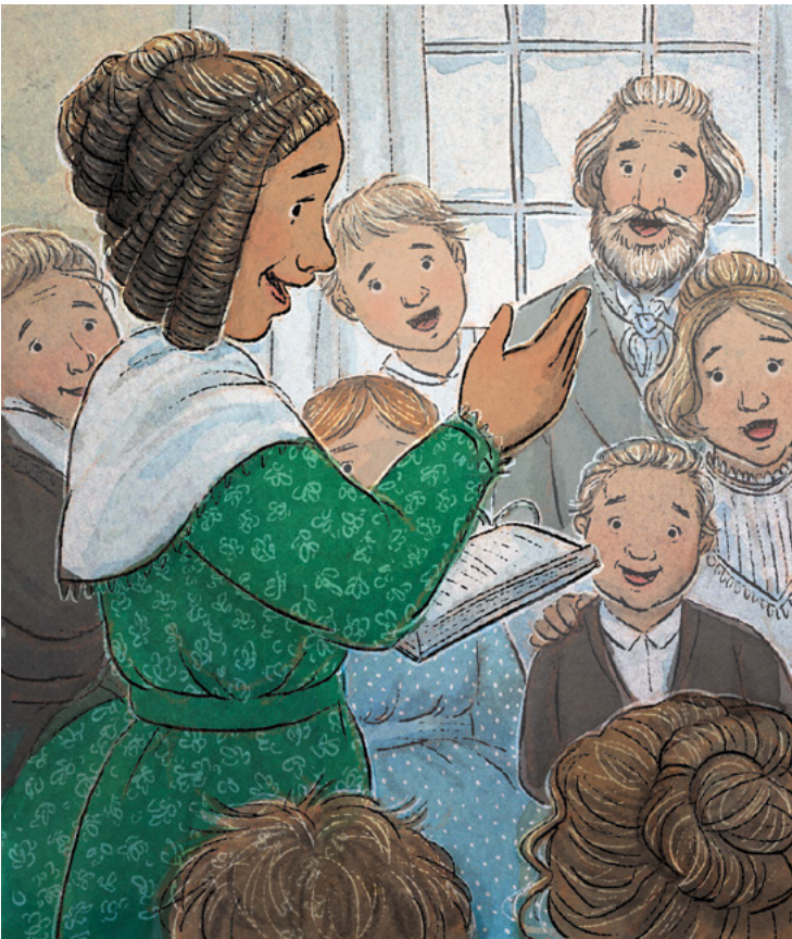
A few months later, God called Emma Smith to put together a songbook for the Church. That way people could sing songs during Church meetings.