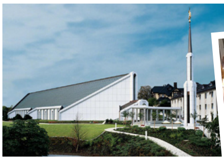
The temple was closed so it could be renovated (repaired). Afterward, it had to be dedicated again.

The Apostles minister to people around the world and teach them about Jesus Christ.