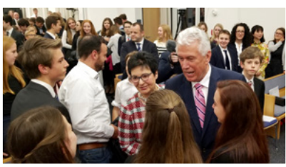
Elder and Sister Uchtdorf also met with the youth. "When you come to the temple, always think of Jesus Christ and what He means to you!" Elder Uchtdorf said.

A dedication of the house of the Lord is a time of joy. It is a time of gratitude.*