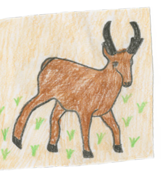
Roan S., age 10, Oregon, USA