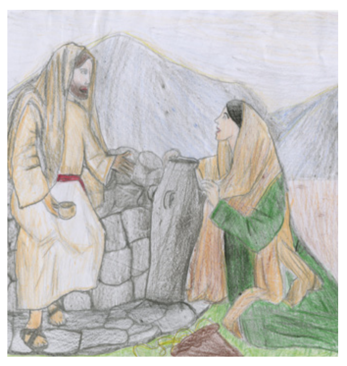
Eliza D., age 10, Idaho, USA