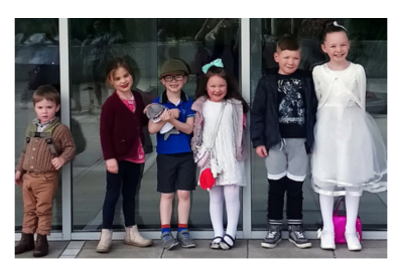
Primary children in Staffordshire, England, visited the Preston England Temple on a stake temple day. They had fun exploring the temple grounds and learning more about the temple.

When I go to church I feel the Spirit strongly. I know God loves me.