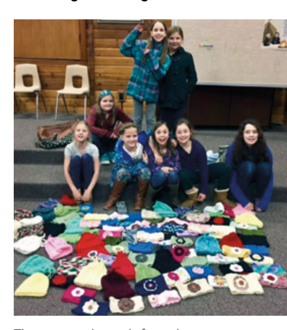
The activity-day girls from the Ketchikan Ward, Alaska, USA, made more than 100 hats and headbands for other children in their community. Each one was unique and made with love!