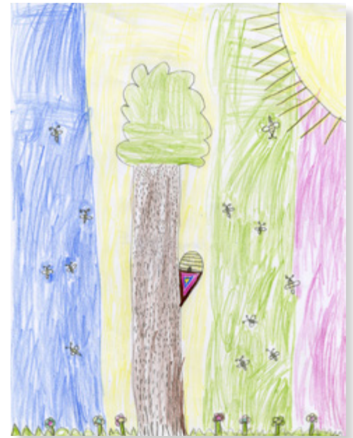
Benjamin E., age 8, Quebec, Canada

When the Grossmont Ward, Santee California Stake, USA , had a temple activity, the Primary children listened to family history stories and ate temple-shaped cookies. Then they took name cards to the youth waiting at the temple to do baptisms. Over 720 ordinances were completed!