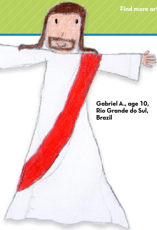
Gabriel A., age 10, Rio Grande do Sul, Brazil

Find more art online at childart.lds.org !