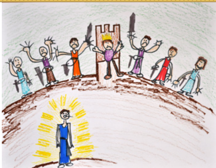
Brooks L., age 8, Florida, USA