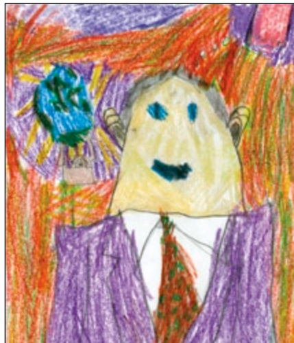
Lisa D., age 10, Utah, USA