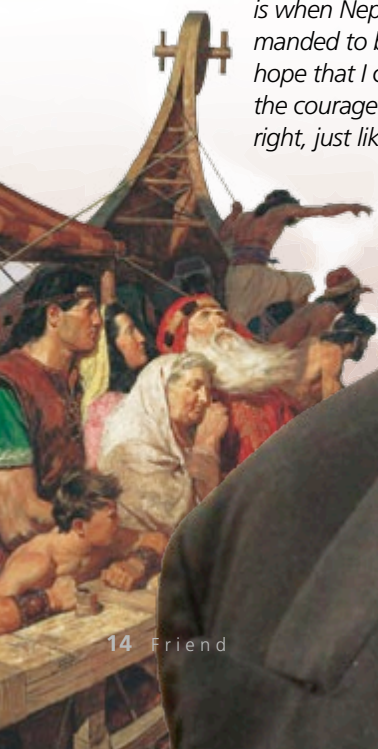
ILLUSTRATION BY BRAD TEARE

My favorite part of Primary is doing the Primary sacrament meeting presentation. I like sharing my testimony of Jesus Christ.