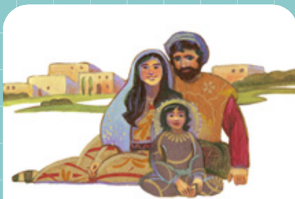
Jesus Christ was the son of Mary and Heavenly Father. Joseph was a wonderful stepdad.