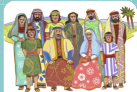
Lehi and Sariah had a large family. Their children didn't always get along.