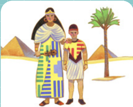
Moses was adopted by Pharaoh's daughter.

Not all families are the same. Here are some pictures of families in the scriptures. Draw your own family portrait in the empty box!