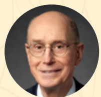
By President Henry B. Eyring Second Counselor in the First Presidency