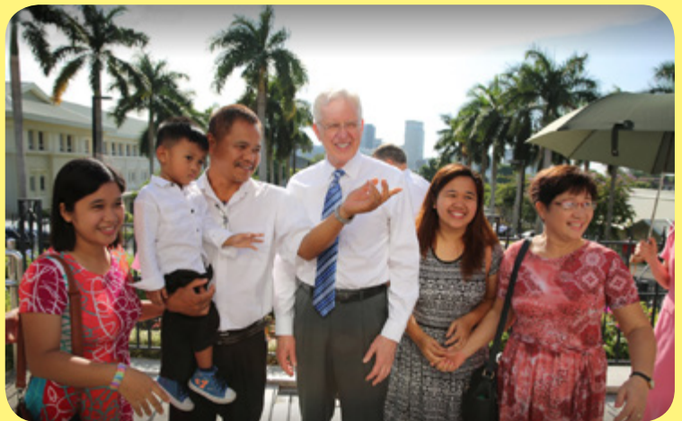
The people were very friendly and kind. Elder Christofferson said if you visit the Philippines, you will come home with a smile on your face!