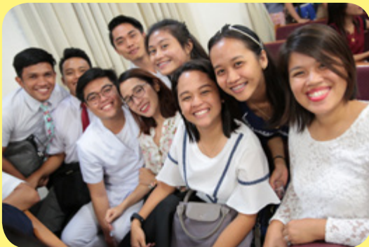
Lots of Church members from the Philippines—especially young women—serve missions. Elder Christofferson said they are known for being good at learning languages.

It is the small things that make huge differences in the lives of individuals and families.