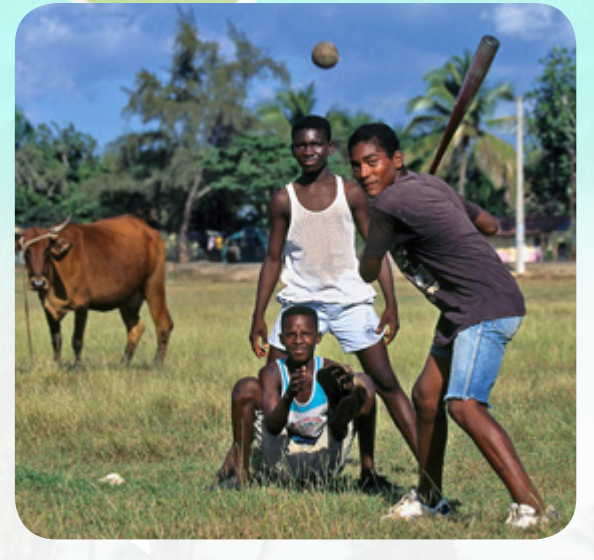
Lots of kids in the Dominican Republic like playing baseball. It's the country's most popular sport.