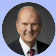
By President Russell M. Nelson