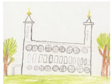
Randon C., age 9, Utah, USA