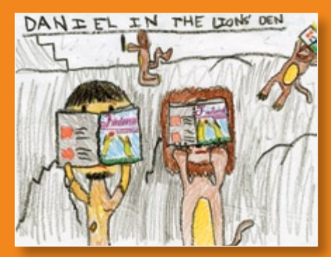
Faith A., age 10, California, USA