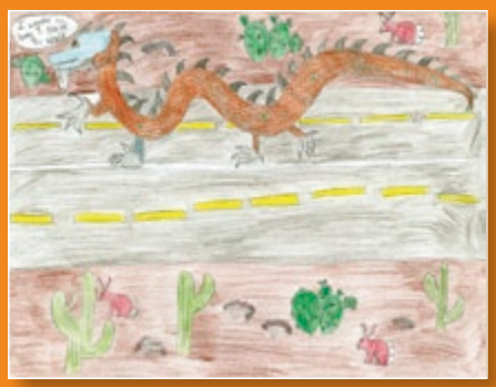
Kohlier L., age 10, West Virginia, USA