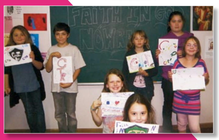
When the Nowra Senior Primary in New South Wales, Australia, had their very first Faith in God night, they wanted to do something special to celebrate! They all created CTR-themed artwork and mailed it in to the Friend!