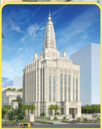
Edwin and Elsie Dharmaraju served their mission in India in 1978. Now a beautiful temple is going to be built there!