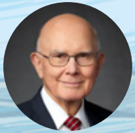
By President Dallin H. Oaks