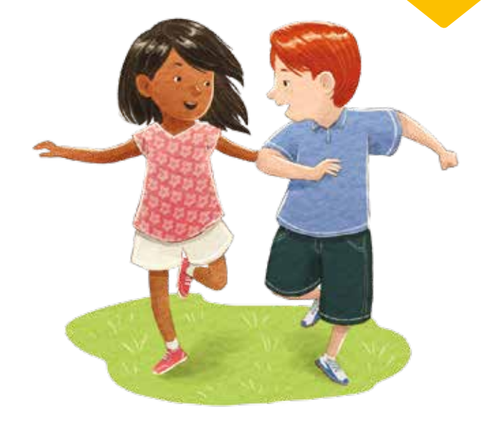
I'm Christian! I forgive all those who choose to do what's wrong. I welcome peace and friendship and help people get along.