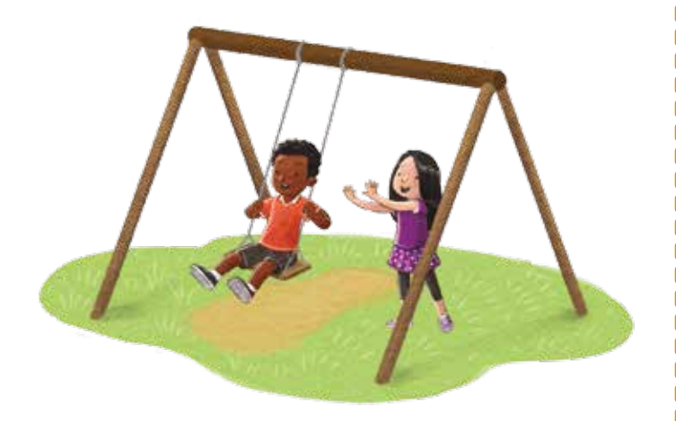
I'm Christian! I use what I have to help my friends in need. I try to do what Christ would do; I'm following His lead.