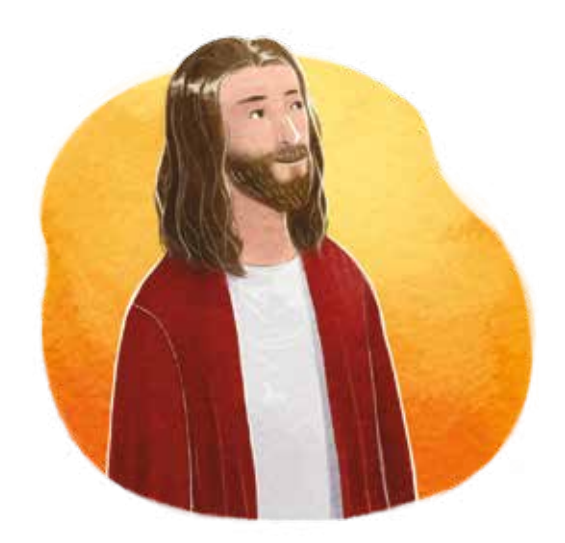
I'm Christian! I believe that Christ is God's Begotten Son-The Prince of Peace, Good Shepherd, Bread of Life, the Holy One.