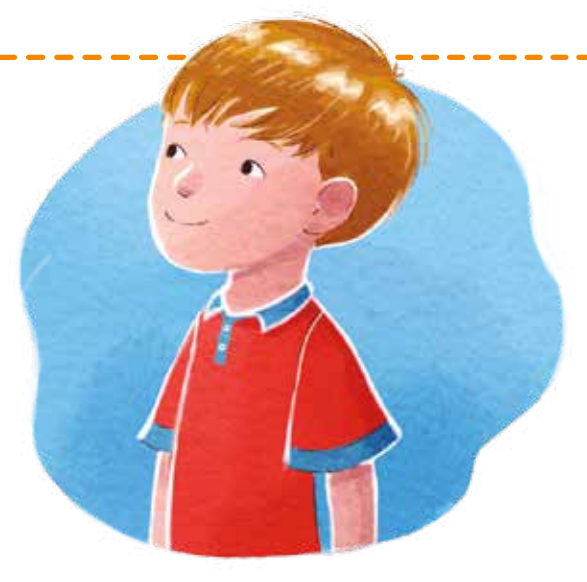
I'm Christian! Even when alone, I show integrity. I'm honest, brave, and virtuous. You can depend on me.

I'm Christian! I remember Christ the way He asked us to: I take the sacrament each week and promise to be true.