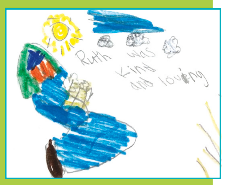
Kylee Q., age 8, Virginia, USA