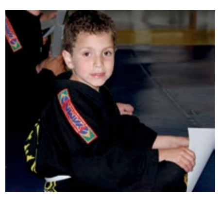
I love to play football (soccer). Another sport I like is hapkido, a kind of martial art from Korea.