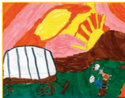
Ellisyn P., age 8, Utah, USA