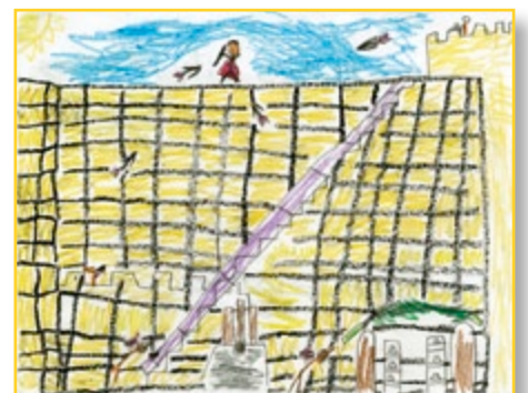
Luke B., age 7, Kansas, USA