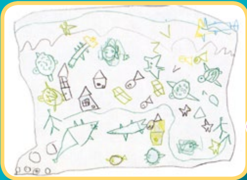
Clayton L., age 4, Singapore

Would you like to send us a poem or drawing? Turn to page 48 to find out how.