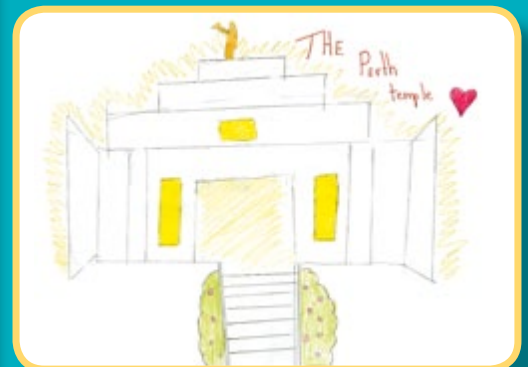
Alana P., age 11, Western Australia, Australia