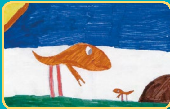
Chase E., age 7, Texas

Would you like to send us a poem or drawing? Turn to page 48 to find out how.