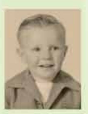
At 18 months

temple, it is important for you to prepare now for that sacred opportunity.