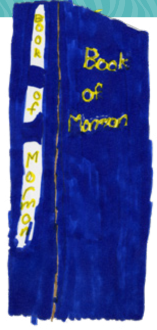
Owen H., age 9, Arizona, USA