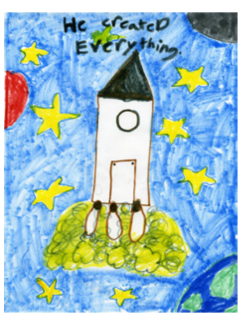
Riley B., age 8, Maryland, USA