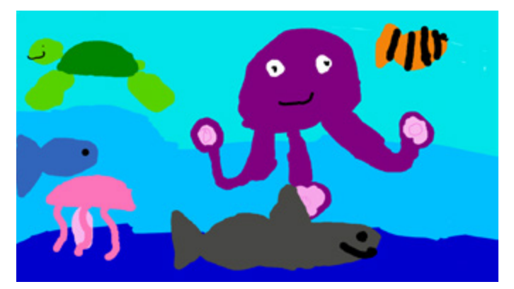
Philip W., age 8, Lancashire, England