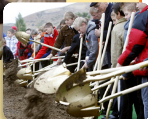
At the groundbreaking, Elder Dallin H. Oaks invited all of the new deacons to come up and break the soil.

Join us each month to see how the Payson Utah Temple was built!