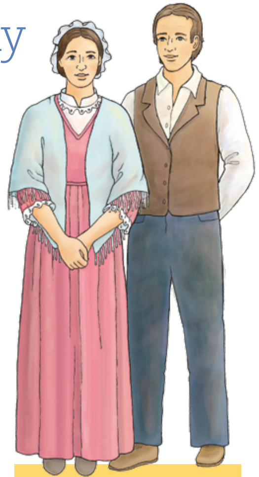
Lucy Mack Smith and Joseph Smith Sr. (Joseph's parents)