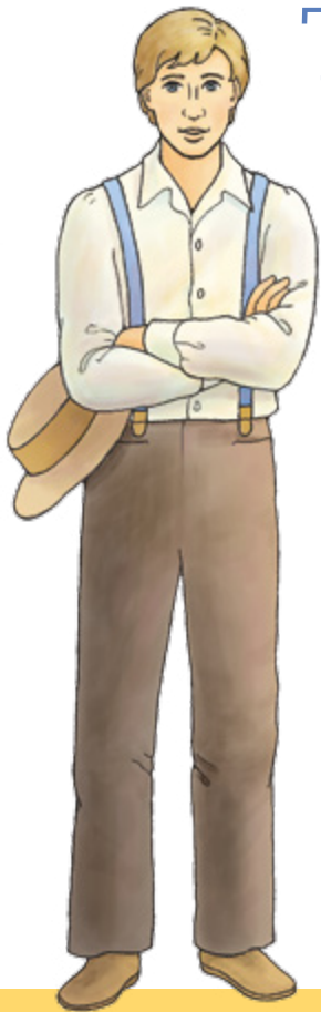
Joseph Smith Jr.

Use these to share Church history stories!