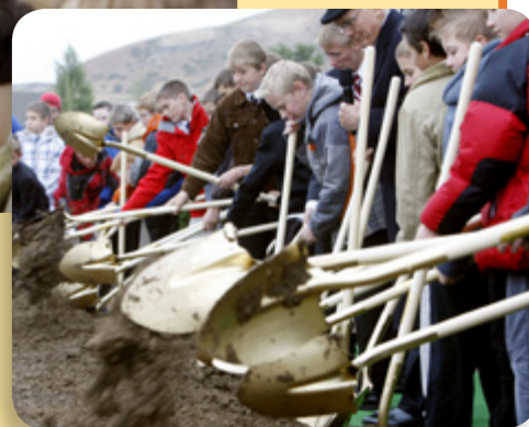
At the groundbreaking, Elder Dallin H. Oaks invited all of the new deacons to come up and break the soil.

Join us each month to see how the Payson Utah Temple was built!