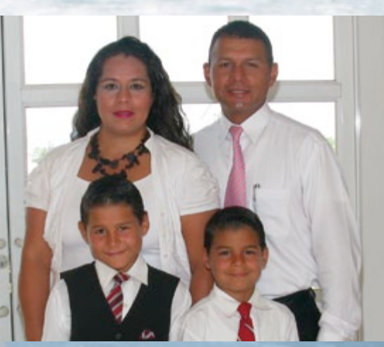
Our parents were sealed in the Guadalajara Mexico Temple in 2003. This is the closest temple to where we live. It takes about six hours to drive there. We love to visit the temple and know that someday we will go inside, just like our parents do now.