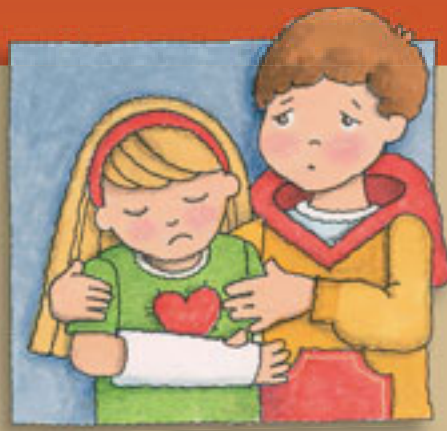
Compassion—3 Nephi 17:6