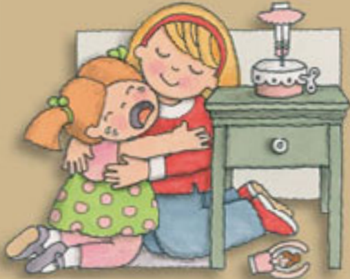
Forgiveness—Doctrine and Covenants 64:10