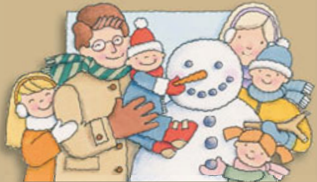
Wholesome recreational activities—1 Nephi 1:1