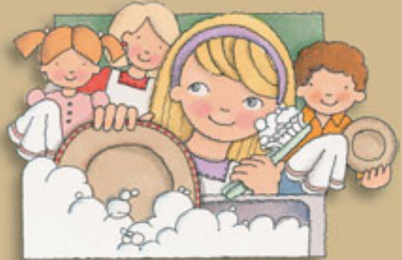
Work—2 Nephi 5:15