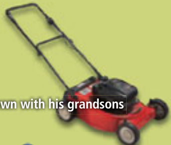
Mowing the lawn with his grandsons