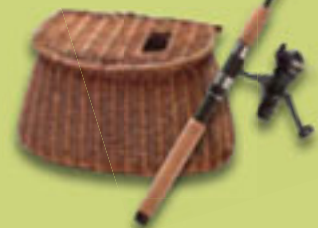
Going fishing in the Provo River