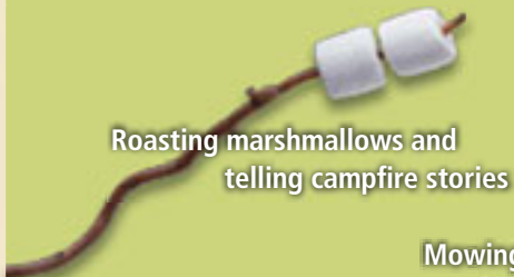
Roasting marshmallows and telling campfire stories

Like the woman in the story, President Monson is known as a happy person. Look below to find out some of the things President Monson has enjoyed doing with his children and grandchildren.