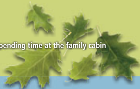
Spending time at the family cabin