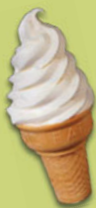
Taking his children out to get ice cream