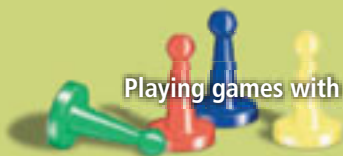
Playing games with his children