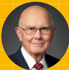
President Dallin H. Oaks, Apostle and former Utah Supreme Court Justice

Was told by his first violin teacher that he would never be successful.