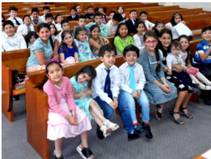
Primary children in the San Luis Province, Argentina , practiced for the Primary program and were excited to present it!