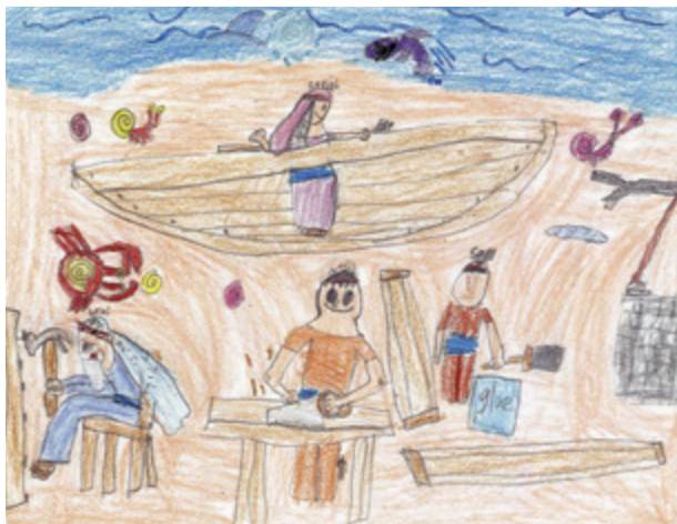
Corinne I., age 7, Idaho, USA