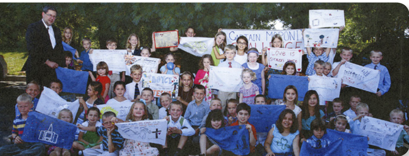
The Rockwood 2nd Ward Primary, St. Louis Stake, Missouri, USA , made family banners. The children drew pictures and wrote what was important to their own family.